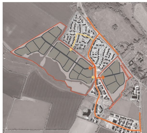
Main vehicular access points and circulation