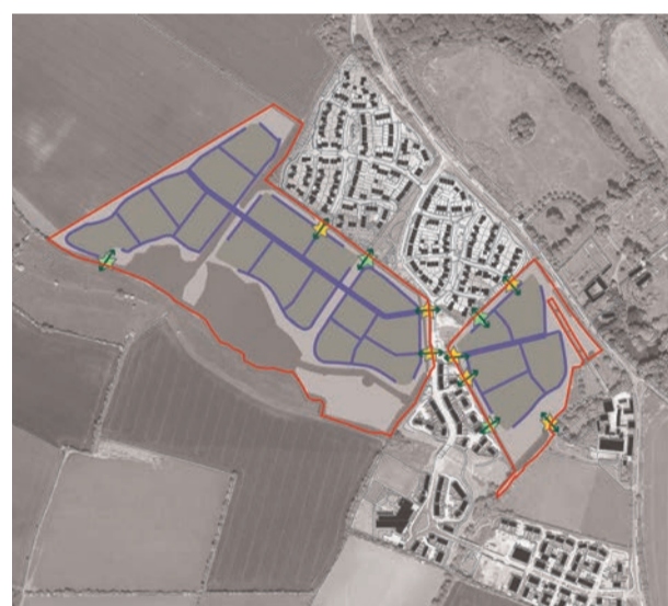
Create streets as social spaces