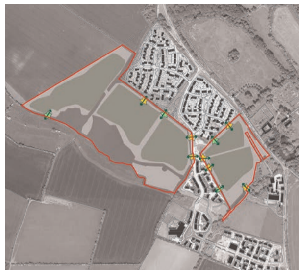
Pedestrian and cycle connectivity