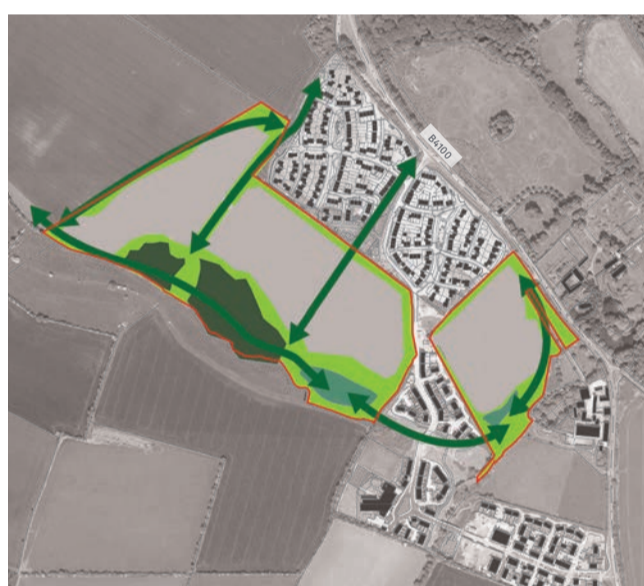
Create landscape and biodiversity corridors