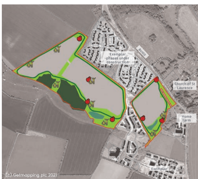
Create new multi-functional green space based on edible, ecological and active landscapes