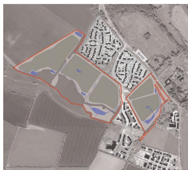
Create a comprehensive Sustainable Urban Drainage System (SuDS)