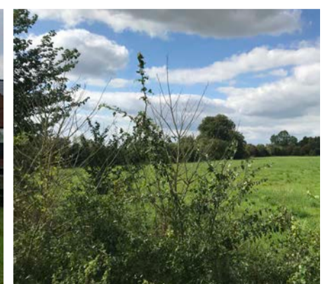
View of western fields of Land at North West Bicester