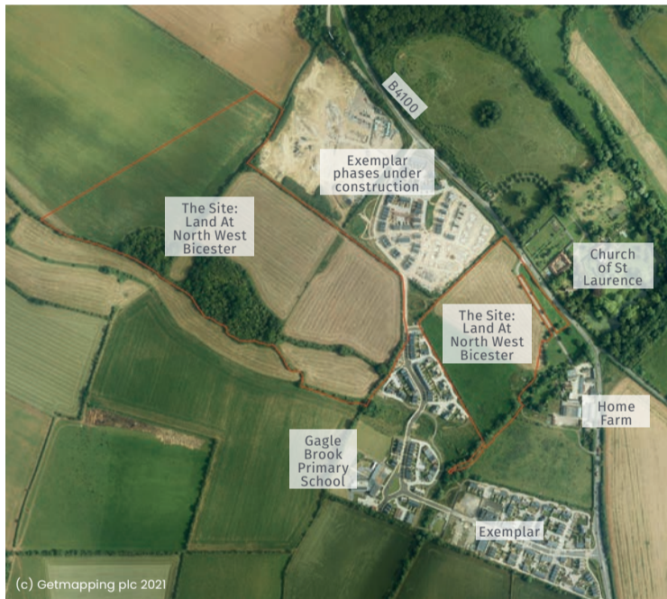
Aerial Site plan - 2021