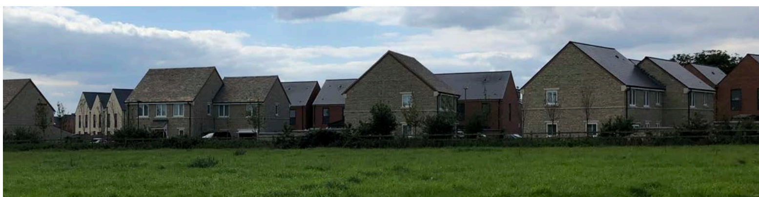
Looking across the eastern parcel of Land at North West Bicester towards the Exemplar Site